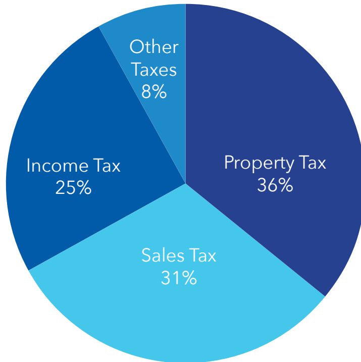
Nebraska's "Three-Legged Stool" Nebraska State & Local Tax Revenues, 2012